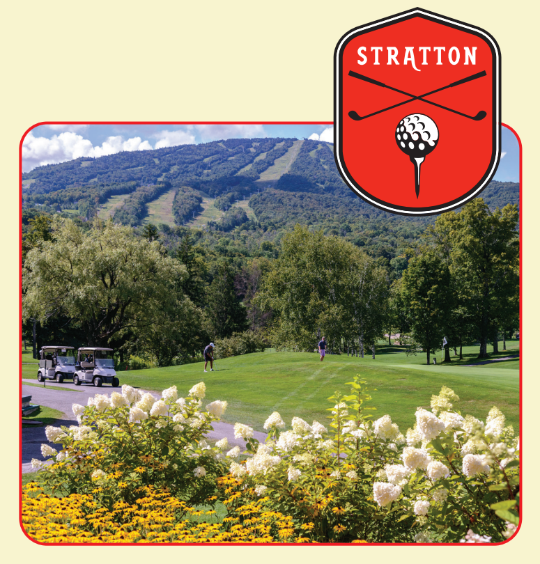
STRATTON MOUNTAIN RESORT GOLF COURSE Stratton Mountain, Vermont

Stratton Mountain, Vermont · Stratton.com Tee Times: 802.297.4118 · 1.800.Stratton Home of Stratton Golf School · 802.297.4165