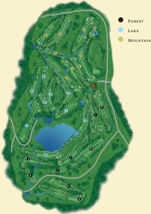
Stratton Mountain Golf Course Established 1964